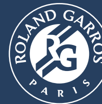
FFT/Dir. Roland-Garros/Dir. Communication • Plan stade : © Art. Presse

LAST EIGHT CLUB "LE ROLAND-GARROS" RESTAURANT